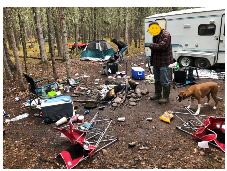
Photo 9 – Messy site with campfire from previous evening in the Saunders Area near Nordegg