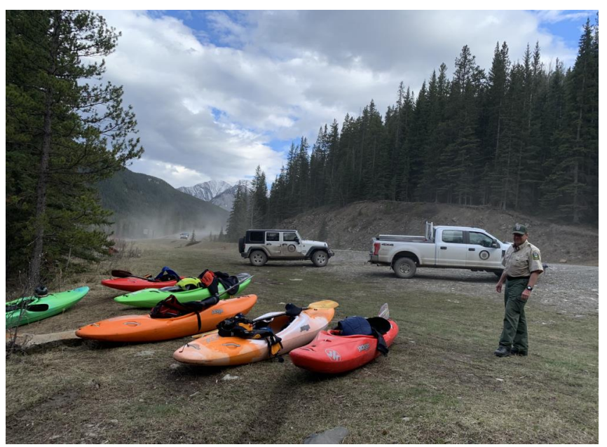
Photo 14 - Patrol done by Lands Officers in the Crowsnest Pass Area