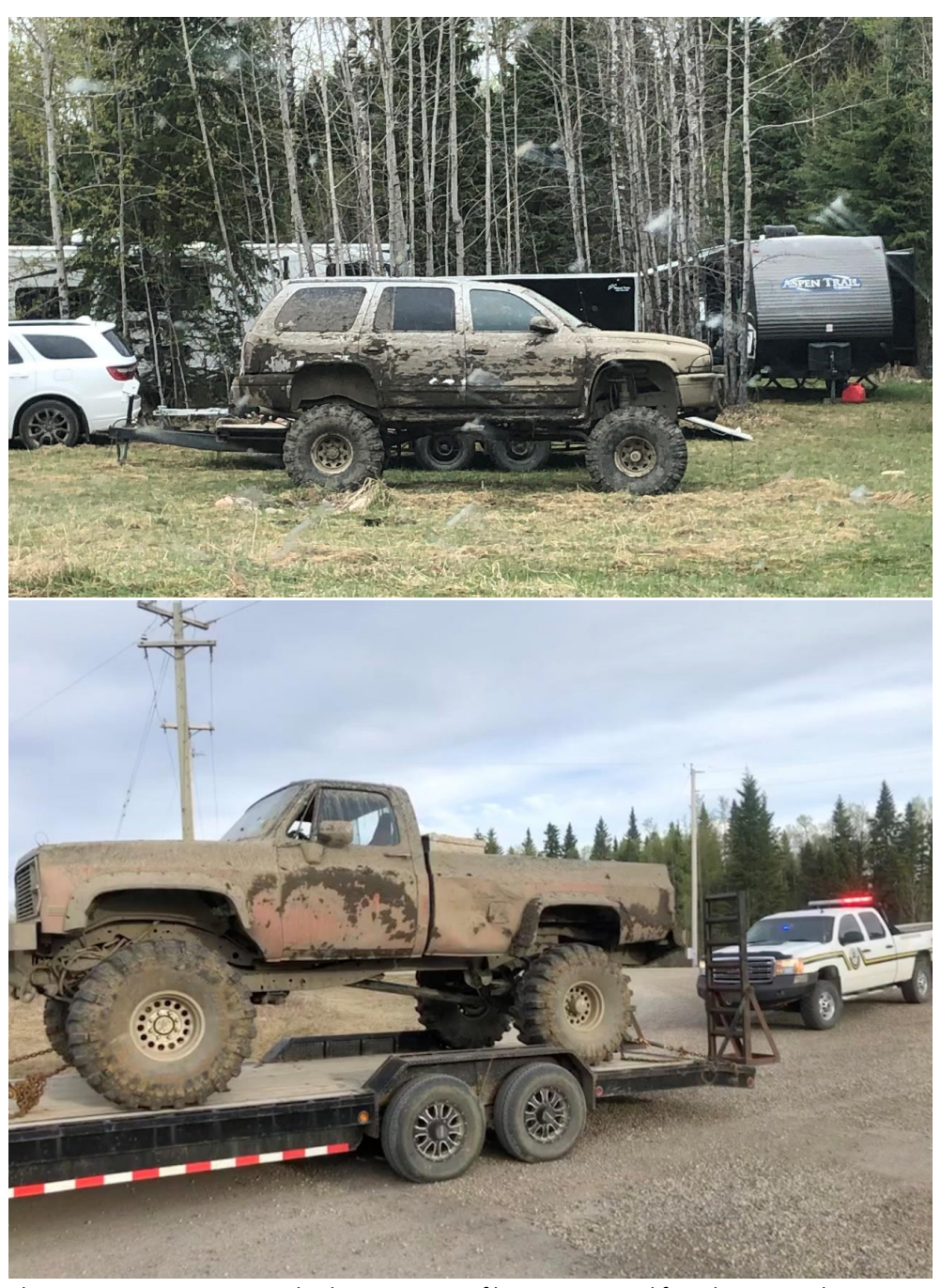
Photos 17, 18 – Monster Trucks that were part of larger group and found some mud