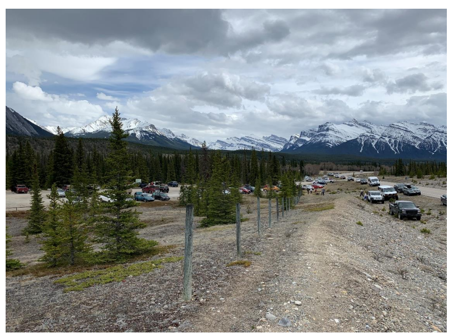
Photo 13 – Busy area west of Nordegg (Siffleur Falls trail head) with staging area overflowing. Picture does not do justice and this was taken on the way home after the area cleared out.