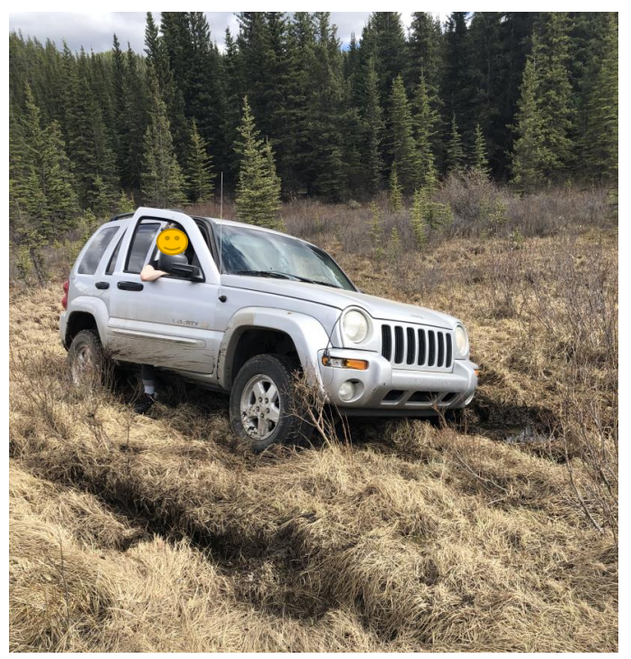
Photo 7 – Vehicle stuck next to Forestry Trunk Road near James River