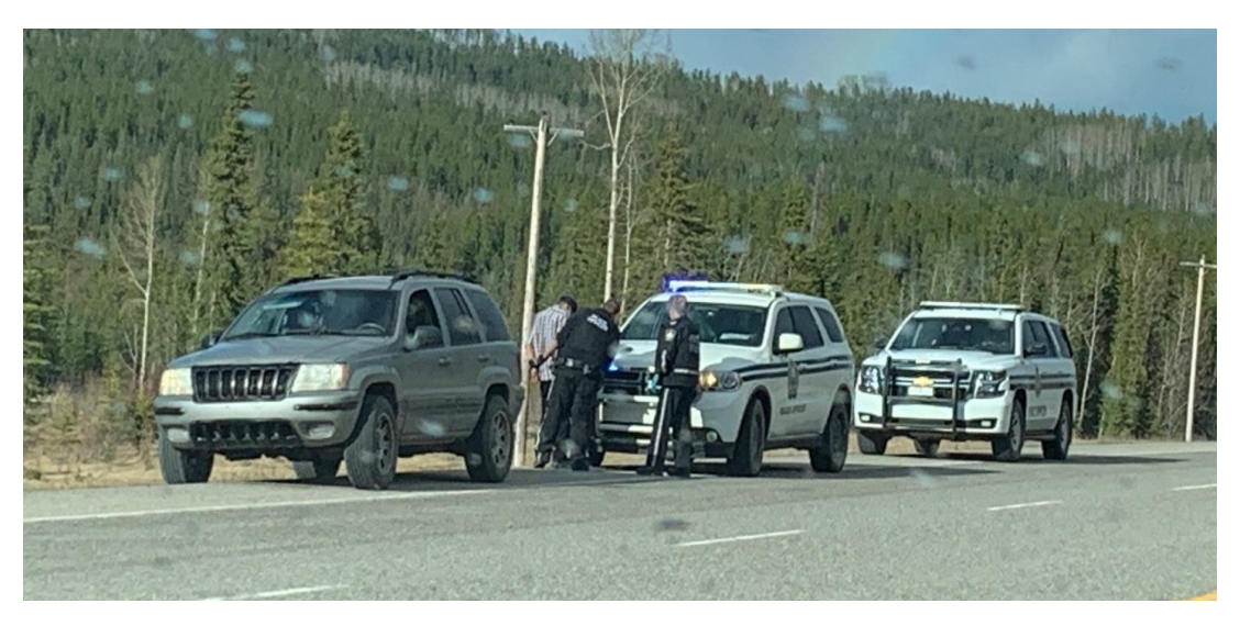
Clearwater County and Rocky Mountain House Peace Officers working together