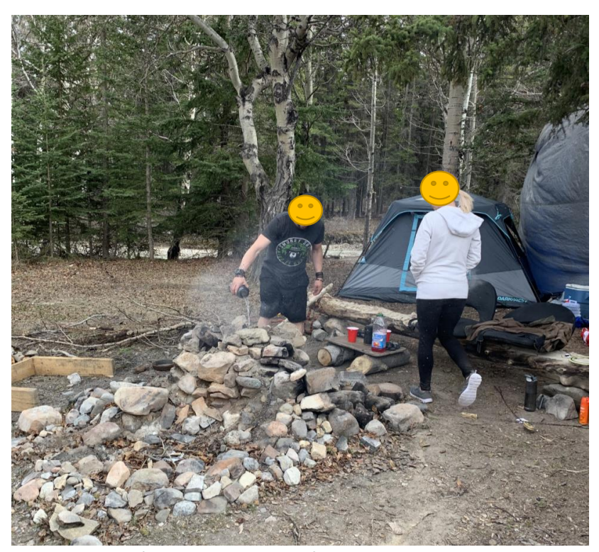
Photo 15 – One of the many illegal campfires observed over the weekend. NOTE: T-shirt reads, "Smokey Says Keep it Green"