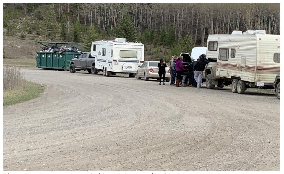
Photo 12 – Dumpsters provided by AEP being utilized in Crowsnest Pass Area