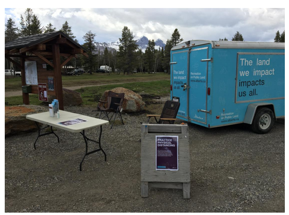
Photo 11 – Educational/Information booth with COVID-19 messaging in the Crowsnest Pass Area