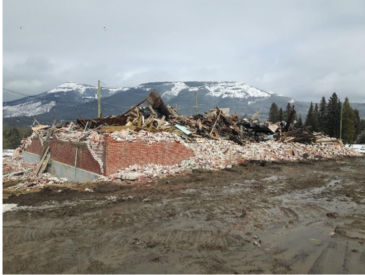
Figure 1.0 Demolition of Nordegg Bighorn Store