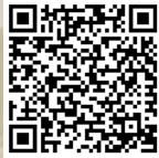
Alberta Parks Listing Link

While the above parks are the most well-known, David Thompson Country has over twenty Provincial Parks, Provincial Recreations Areas and Wilderness Areas for you to explore. You can find them listed at the link.