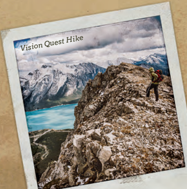
Vision Quest Hike