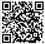
Alberta Public Lands Link

DTC has a variety of trails to explore, from multi use trails to motorized and non-motorized specific trails. Our hiking trails vary in difficulty from short walks suitable for a soft adventure seeker to hikes that will challenge the hard-core adventurer. Mountain and trail biking are popular activities as well, with Nordegg and Baseline Mountain being two popular destinations. Check the link for the Government of Alberta's Trail information.