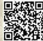
Clearwater Trails Initiative Link

If you're looking for motorized access for your ATV, OHV, or Motorbike there are designated areas for you to enjoy. One area to explore is the Clearwater Trails Initiative west of Caroline and the Bighorn area also has dedicated motorized trails as well. There are plenty of areas for horses and we have ranches and outfitters offering guided trail rides if you have riding a horse on your bucket list! Check the link for Public Lands permitted uses.