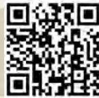
Bighorn Backcountry Trails link