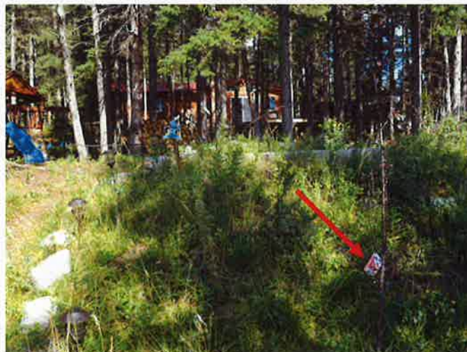
Looking from Crowland back toward cabin #22. Picture with tag is of an apple tree planted 2015.