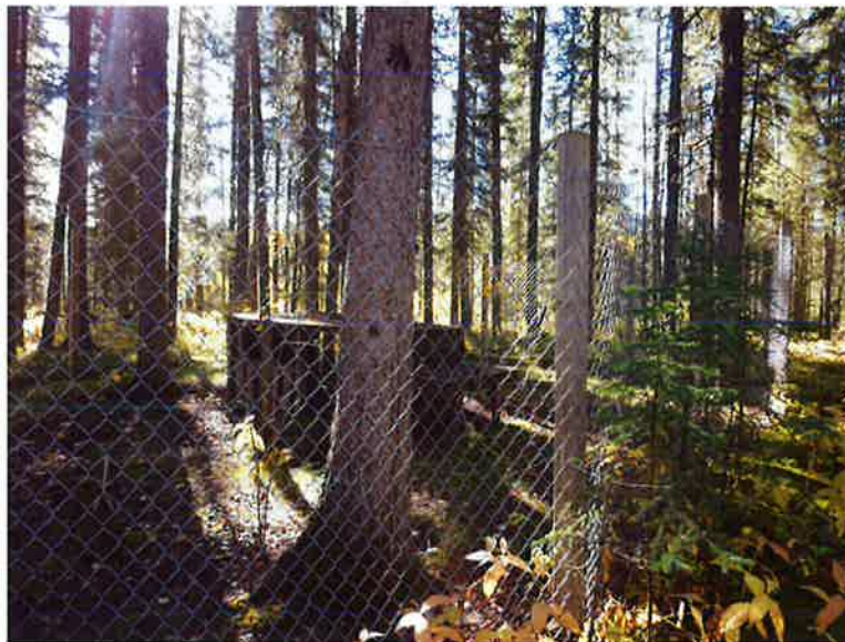
Dog kennel on cabin #24