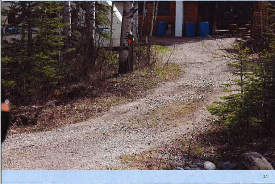
Driveway across Municipal Reserve, Lot # 5