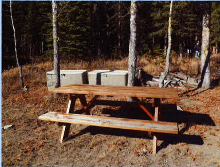
Items on Crown Land – Not applicable, temporary placement