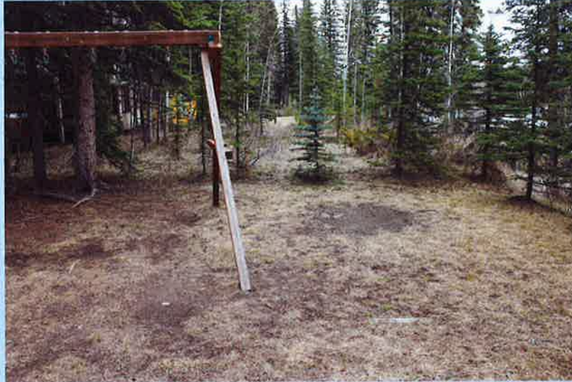
View looking East, showing the tree planted to replace the natural tree that died the year before