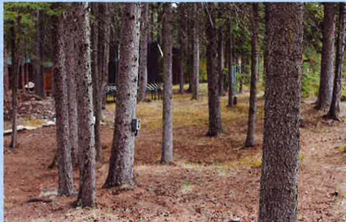
Actual view of landscape, with wildlife camera. Notice the trampoline in the photo for reference.