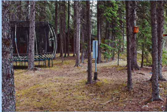
The MR Notice Sign in place where it is suppose to be