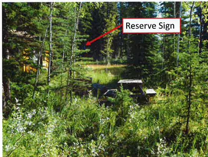
Looking east to cabin #18 and #17 at the pathway on reserve land