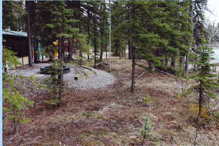
Birdhouse fell over, and tree died last fall. Ample room to walk should someone want to.