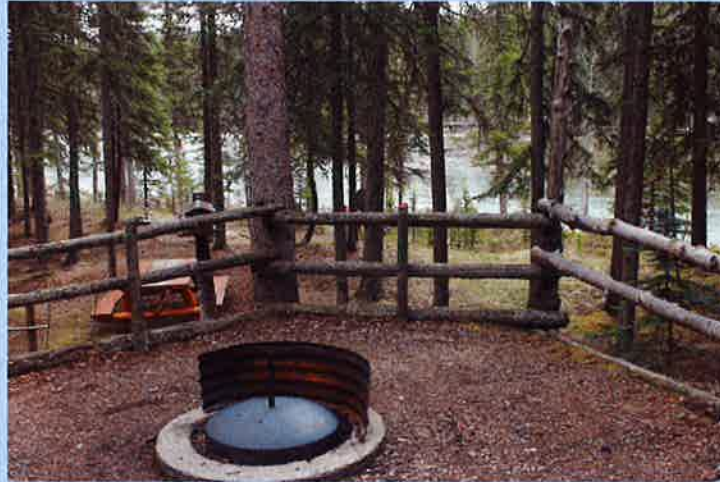
To refute, this is the actual view from Cabin #23. The previous photo was taken skewed to the left.