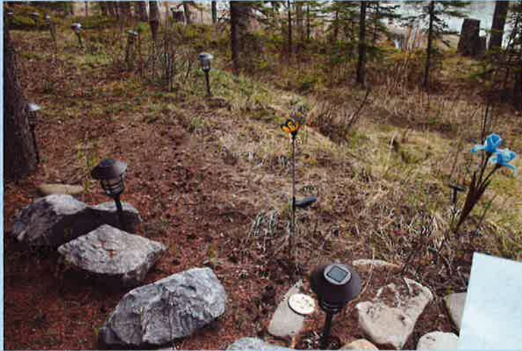
Crown Land Adjacent to Lot #22 – Not applicable