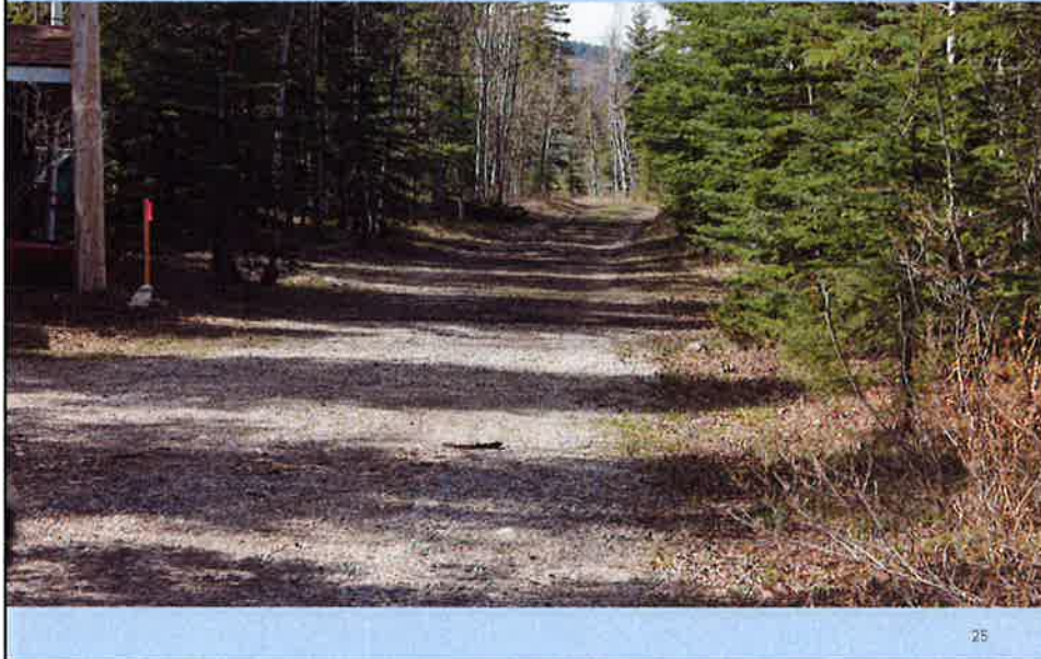
Roadway on Municipal Reserve behind Lot #'s 1, 2, 3, and 4