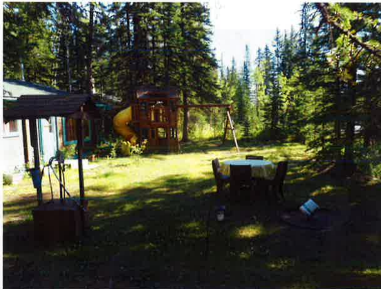
Looking east onto cabin #19 property

(Notice this table is in a different place than in the photo from slide 9)