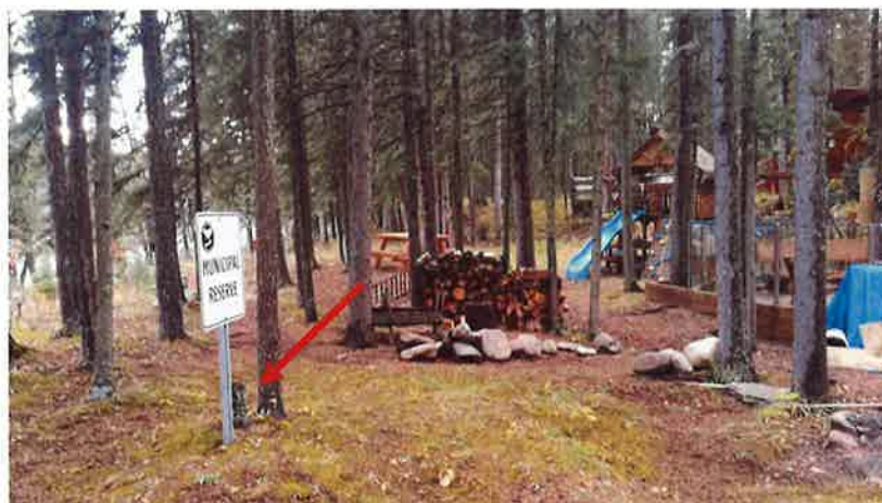
Municipal sign showing where outside of reserve property is. Reserve property is to the right. Notice small stub of a tree next to reserve sign.