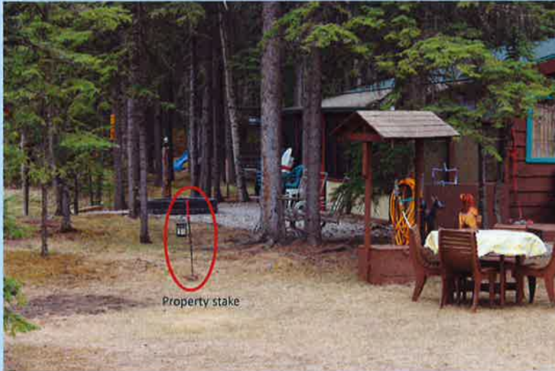
Actual placement of the table, near the cabin and not in the yard