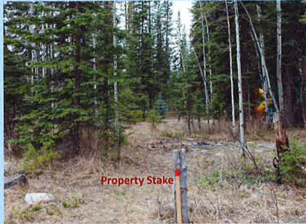
Clear pathway view to Lot #18 from Lot #17