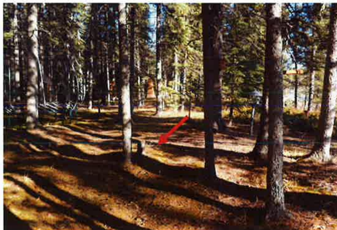
One Week Later looking east on MR Notice Clearwater sign next to stub is GONE .