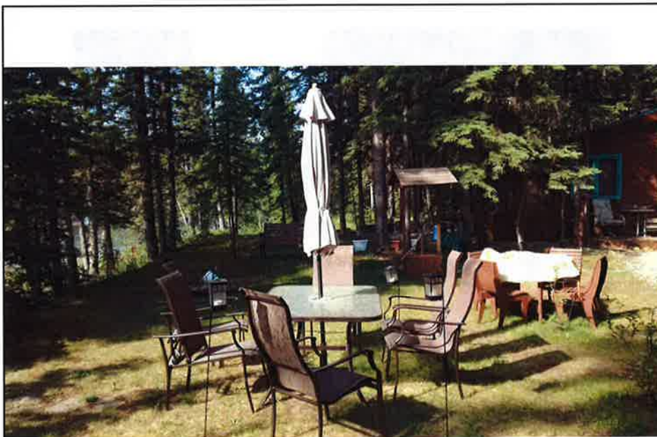
Looking west at cabin # 19