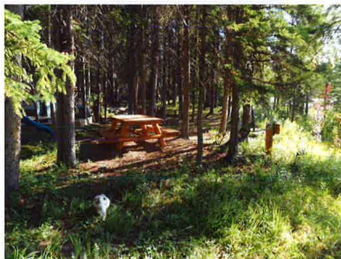
Looking east - Table blocking walking path. End post of fence now acting as bird house.