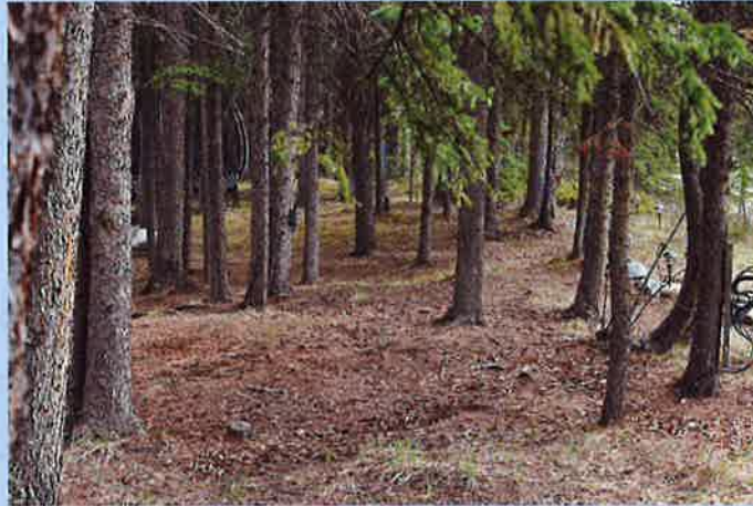
Looking East – No table, nothing to block the 'imagined' path