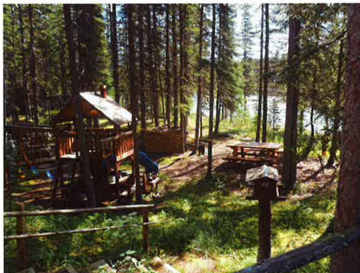
Looking down from top of cabin #23. The bird house with #23 is the demarcation point for the reserve. This is their view of the MR.