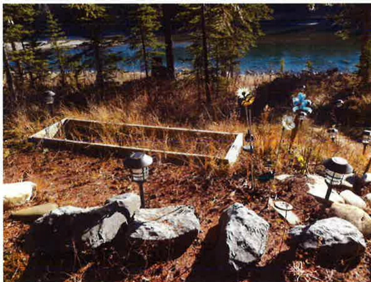
Crown Land Adjacent to Cabin #22