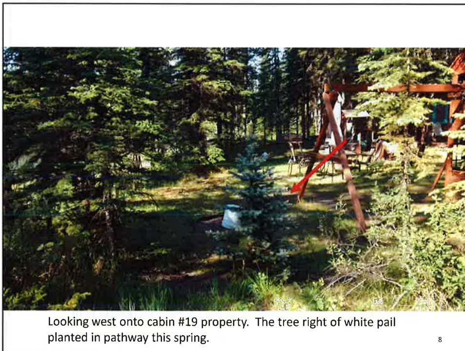
Looking west onto cabin #19 property. The tree right of white pail planted in pathway this spring.