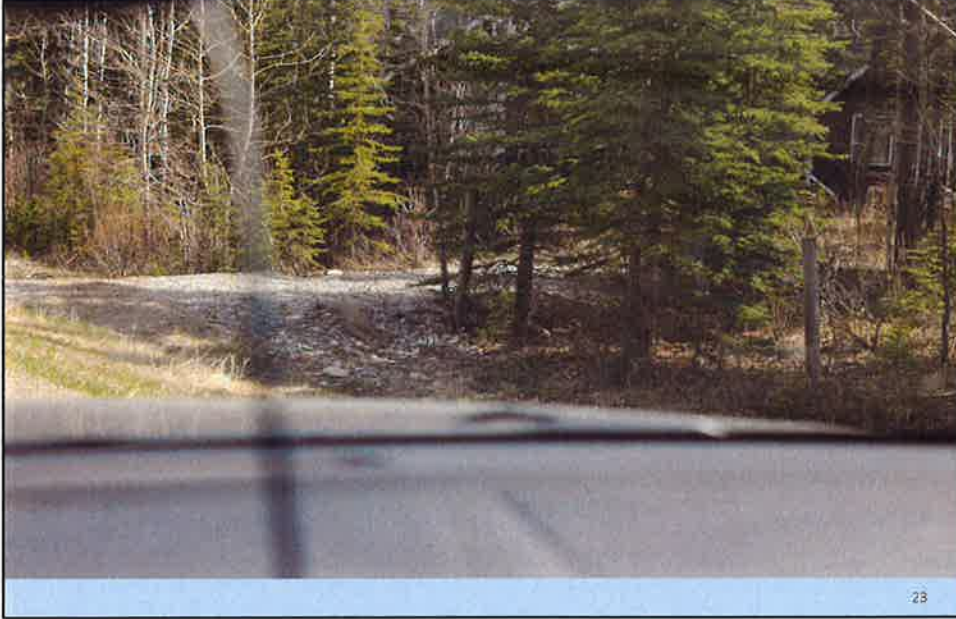
Driveway across Municipal Reserve, Lot # 7