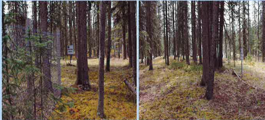
Dog kennel on Lot #24 in relationship to the MR sign. There is ample room around the kennel. Showing two different views for reference.