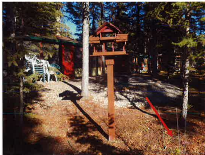
New tree planted and bird house make effective barriers.