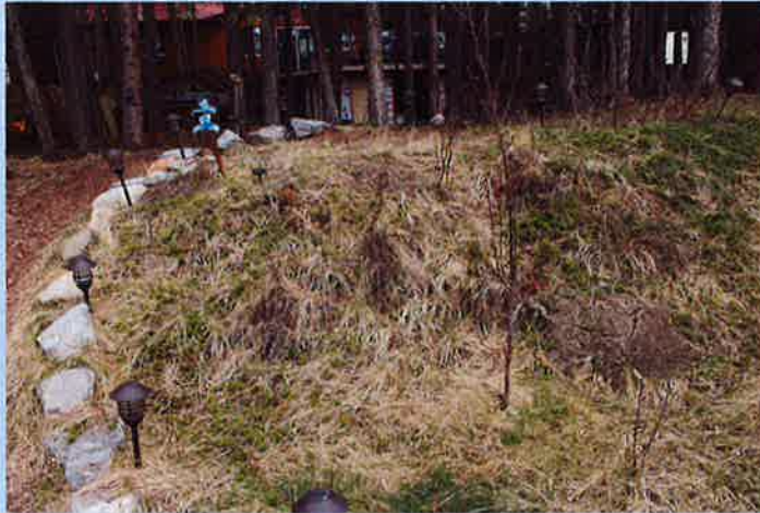
The apple tree is still living and adding to the overall aesthetic of the municipality.