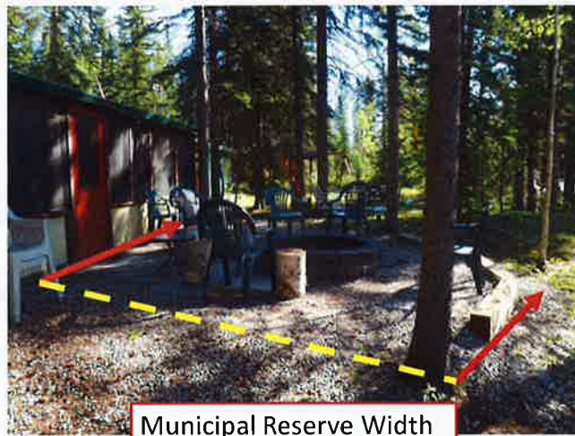
Cabin # 20 reserve land - Outside row of wood is outer boundary of MR