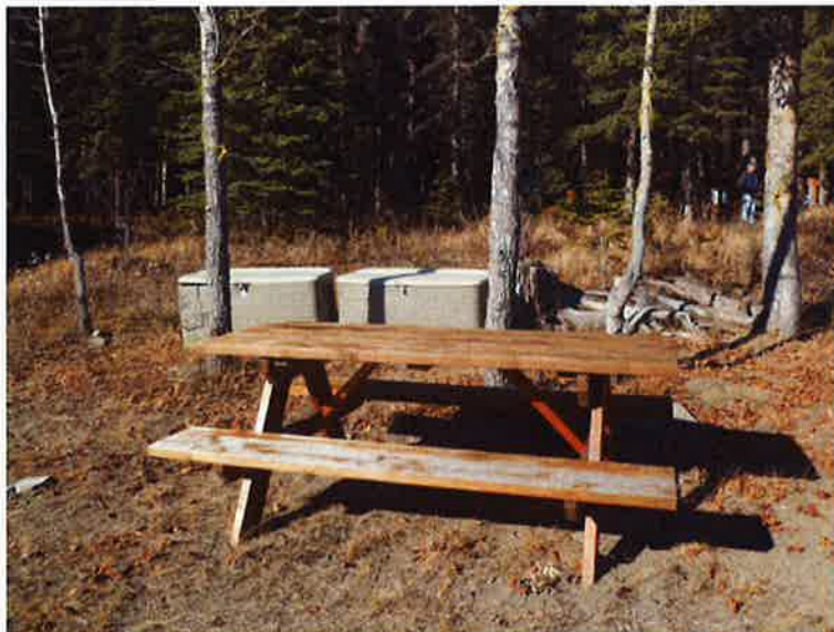
Items on Crown Land adjacent to Cabin #22