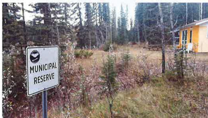
View of walking trail past cabin's #17 & #18