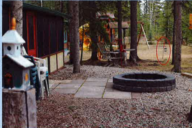
Cabin # 20 fireplace. Note the property peg; and still clearly enough room to walk around.