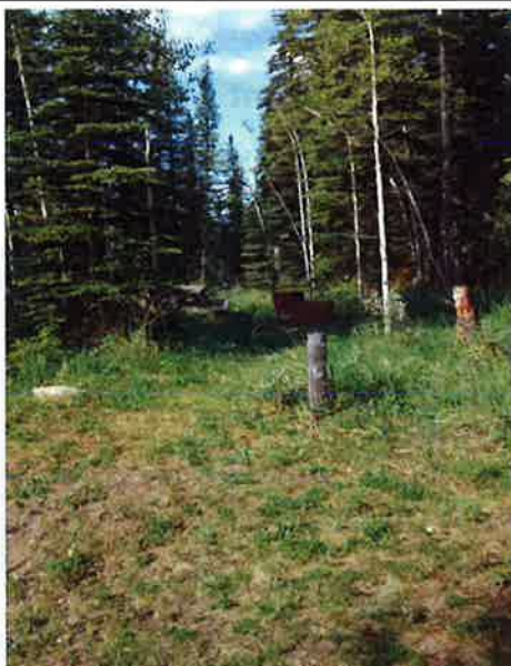
Cabin #18 table, barbecue and fire pit as to approach from cabin #17